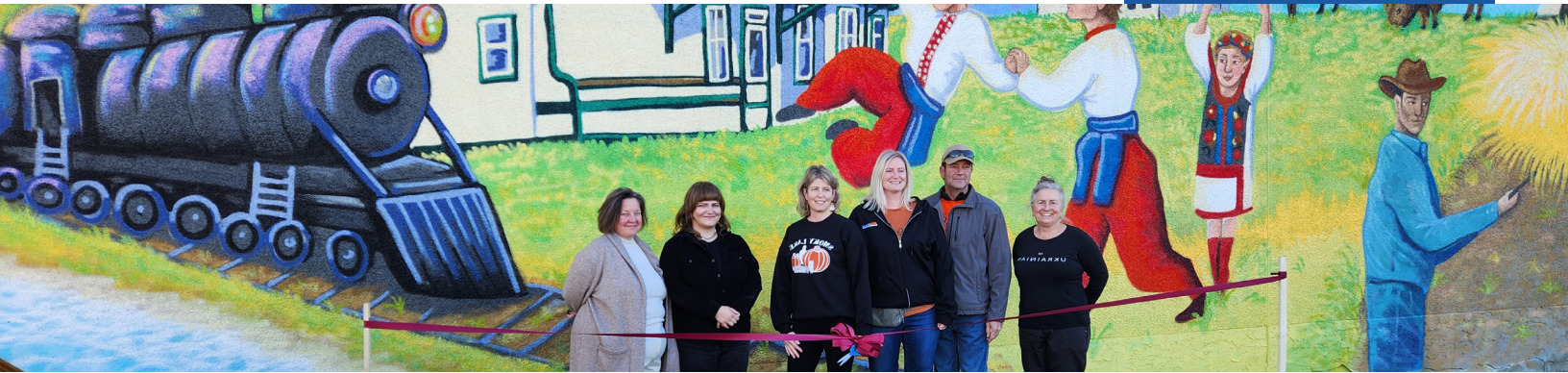
Legacy mural reveal. October 7, 2023. Check out the mural on the west side of the Curling Rink.

Approved Donations: $95.00 for the Smoky Lake Legion.