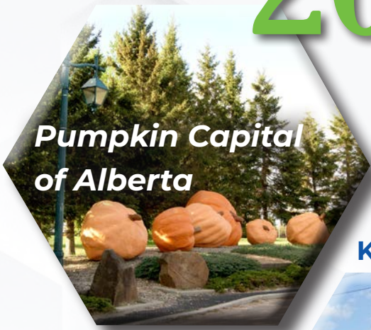
Pumpkin Capital of Alberta